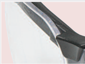
Highest available impact protection as one of the only reading magnifier models certified to ANSI, CSA and Military V 0 Ballistic Test for Impact.