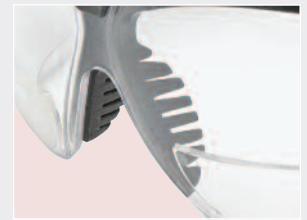
Premier all-day comfort with soft, high-quality elastomer nasal fingers, padded browbar and temple tips.